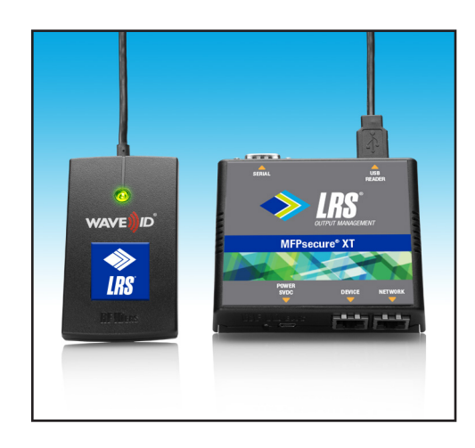
MFPsecure XT badge reader and network interface card

To securely retrieve documents at an MFPsecure XT-connected printer, a user simply taps an access badge on the proximity badge reader. All of the user's queued documents are released at once from the secure LRS server queue to the printer.